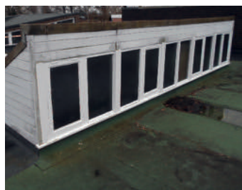
12 Lantern Rooflights