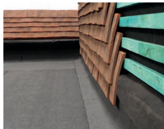
8 Hanging Tiles