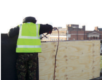
7 Timber Upstands