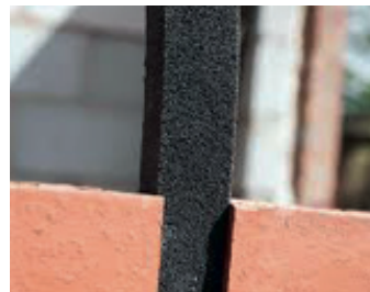
3 Expansion Joint