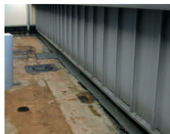
13 Confined Space