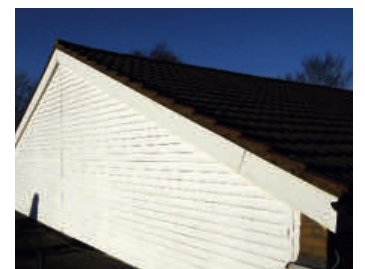
5 Open Perpend