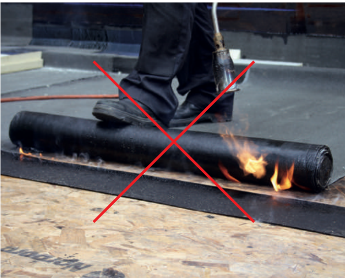
2 Do not torch direct to timber deck